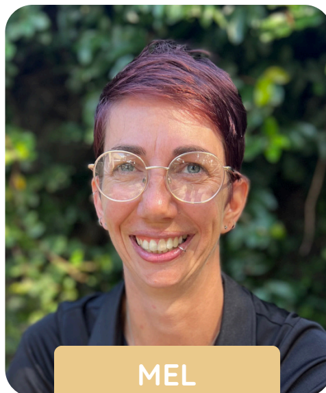
MEL EDUCATION LEADER